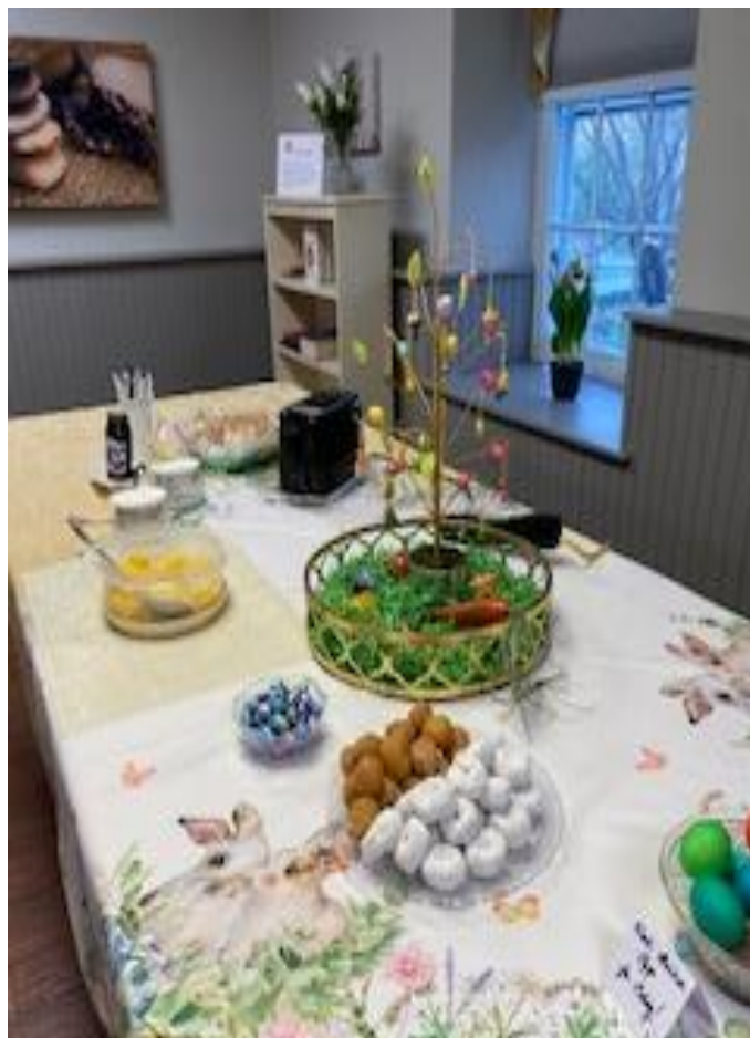
Continental Breakfast following Easter Sunrise Service.