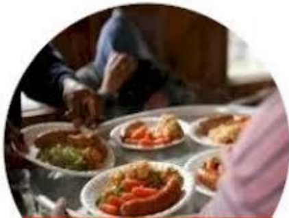
Hope Dining Room

March 10 th was another successful day for us at Hope. We fed 21 clients and 7 workers. We gave out 40 sloppy joes. It was a blessing to minister with you all.