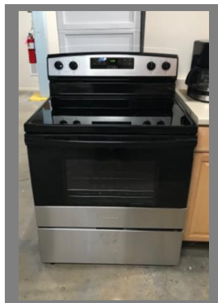
Care and Fellowship's new baby!