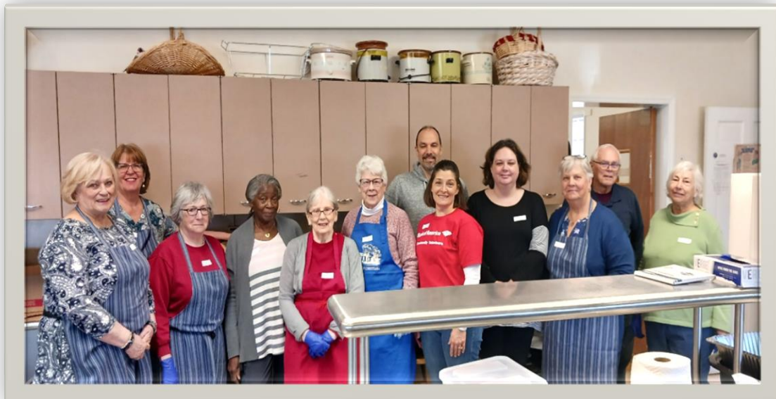
The "Dream Team"

It was great to be inside the dining room once again serving hot lunches after a two year inside absence due to Covid. As always HOC provided a great group of volunteers and delicious food to make this effort a resounding success!