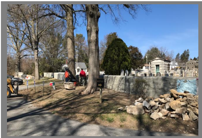
Hard at work rebuilding the cemetery wall.