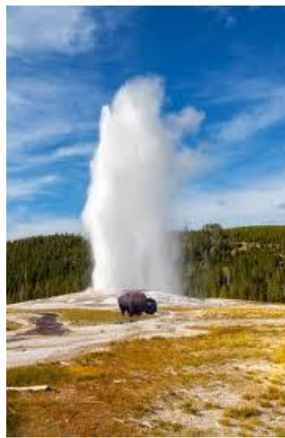
Yellowstone Nat'l Park