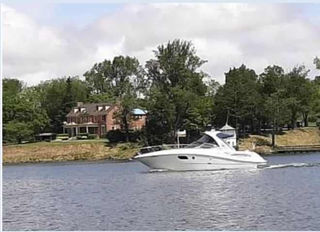
Cruising the Sassafras from North East to Georgetown