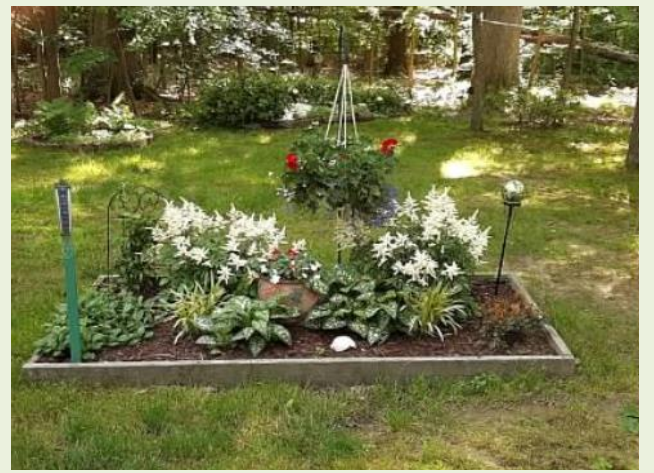
Flower Garden in full bloom!