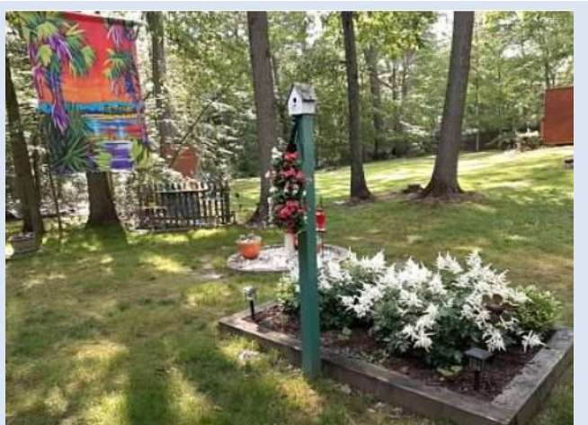
Betsy's Fairy Garden and Flower Beds