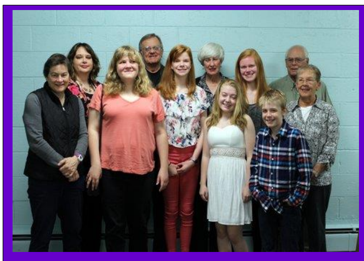
Confirmation Class and their Sponsors