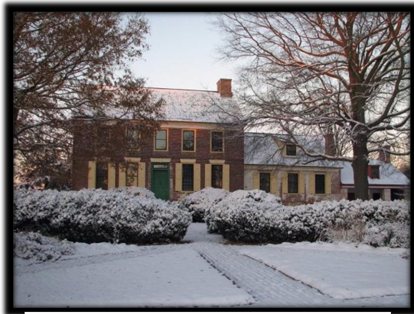
Dickinson Plantation in winter