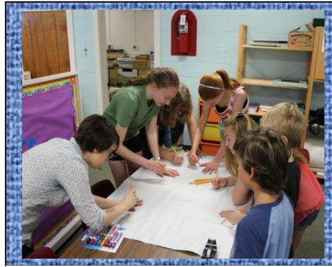
Making hand prints — Hands showing the "good works" (Ephesians 2:10)