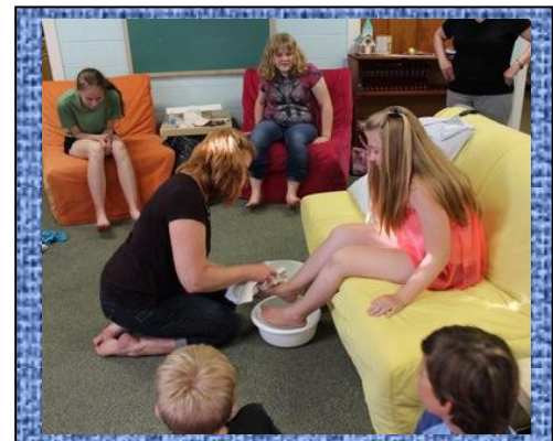
Washing the feet of followers