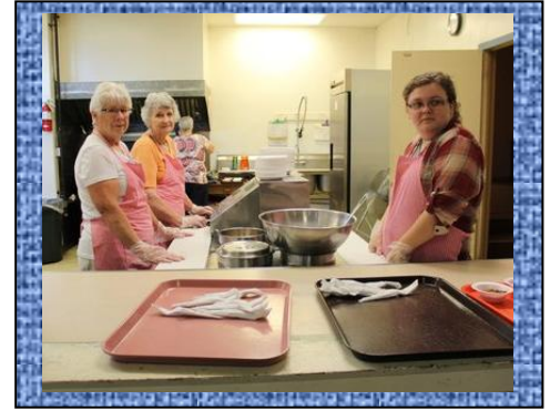
Hope Dining Room