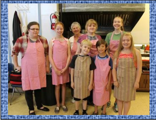
Hope Dining Room servers