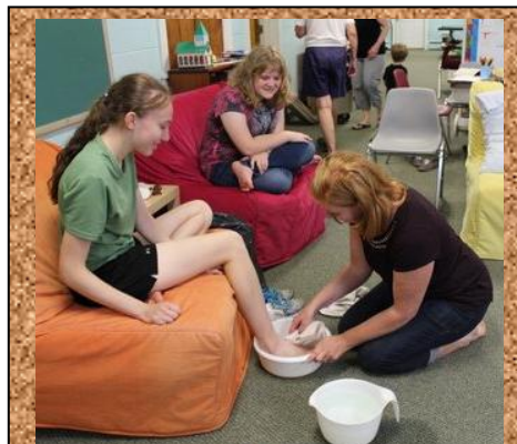
Washing the feet of followers