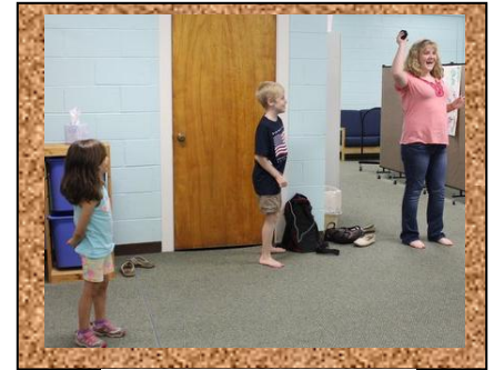
A game of toss