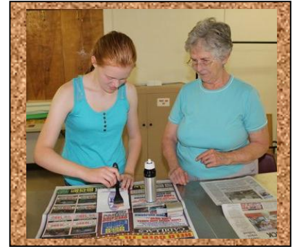
Making beautiful stained glass windows