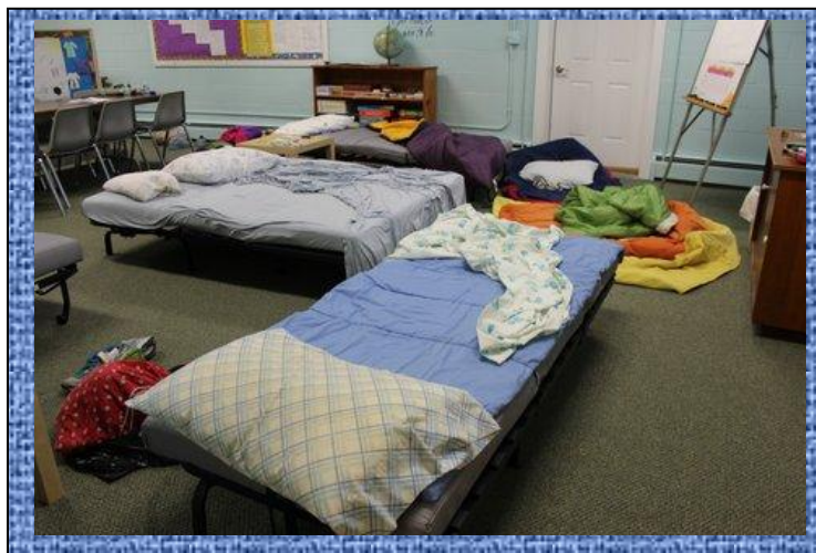
The morning after...