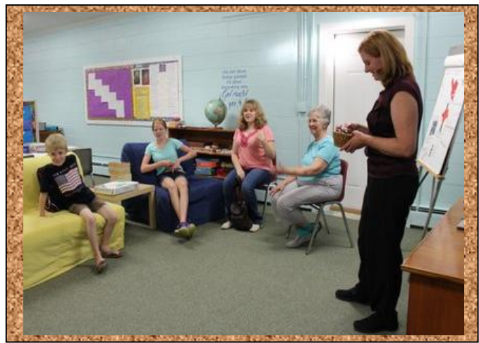
Charades — Words and phrases from our Bible Study