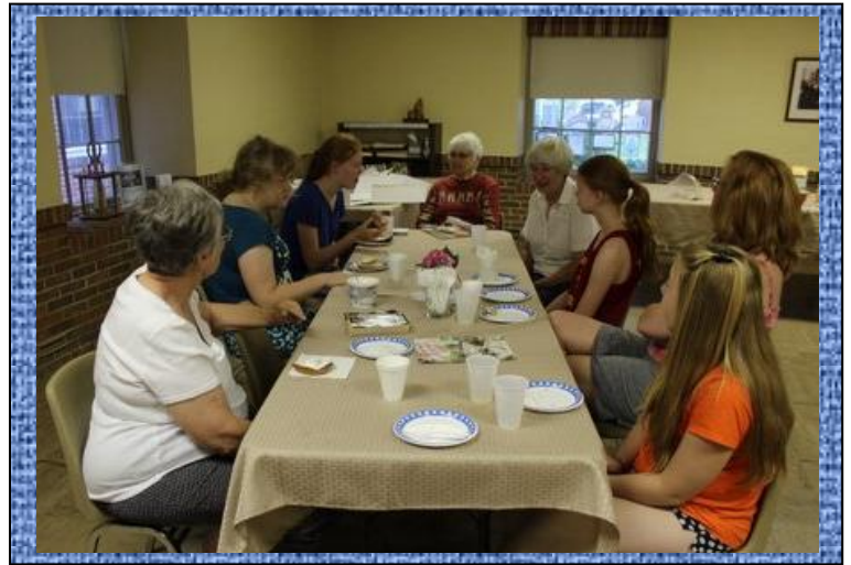
A nice meal after a fun day