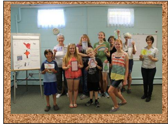
Finished stained glass pictures