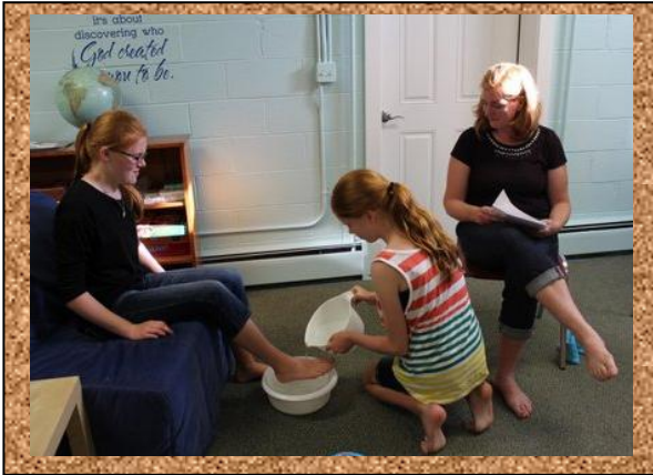
Everyone gets a turn...