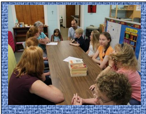
Bible Study — “Salt of the Earth, Light of the World” (Matthew 5:13-16)