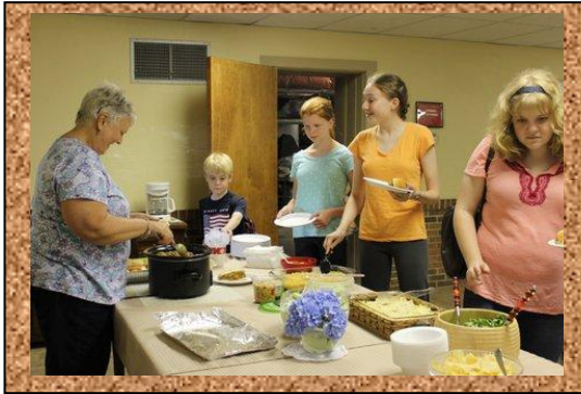
Pot Luck Supper — Yum!