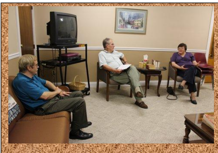
Adult Bible Study