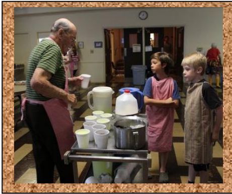
Hope Dining Room Helpers